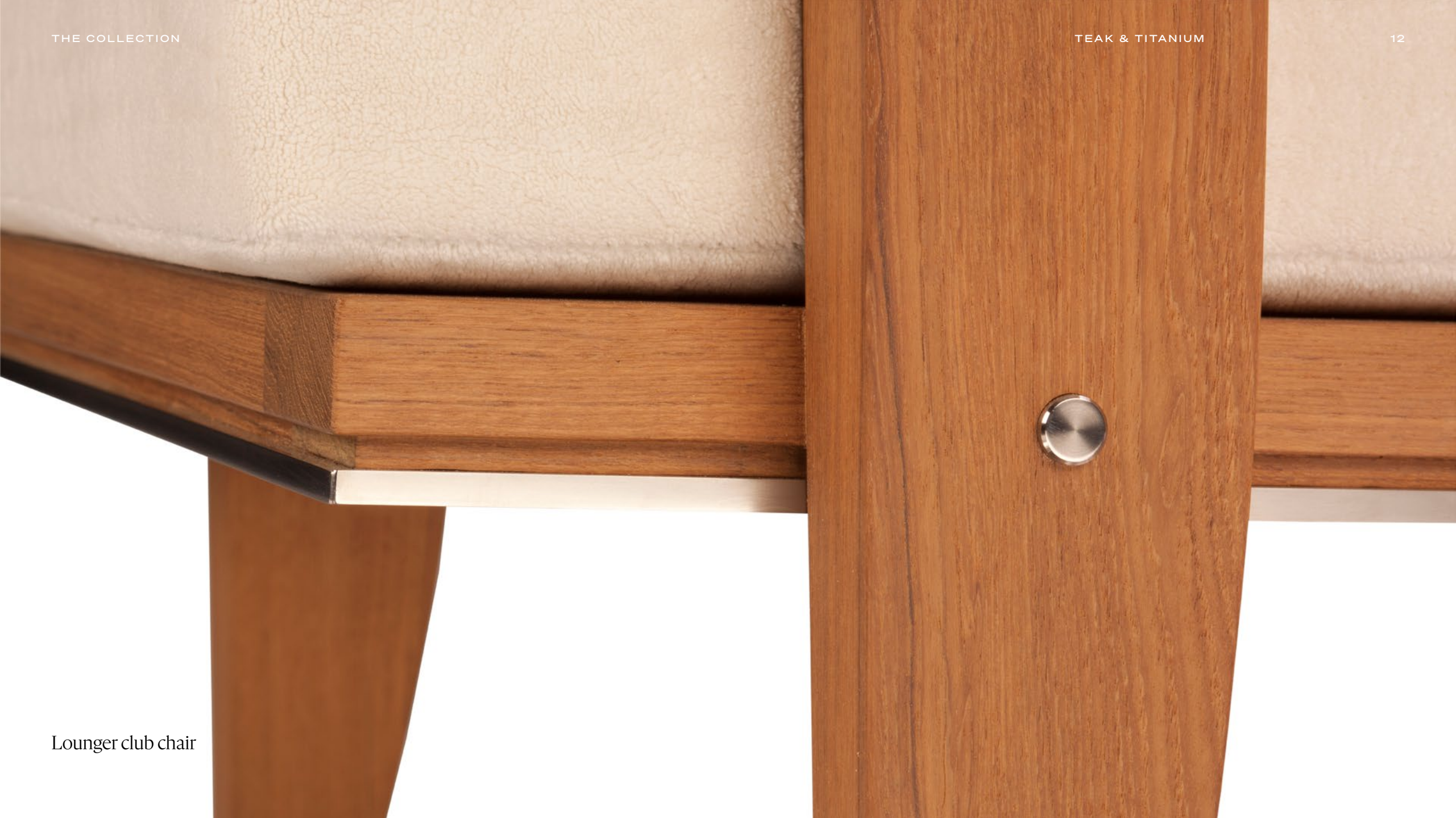
Lounger club chair