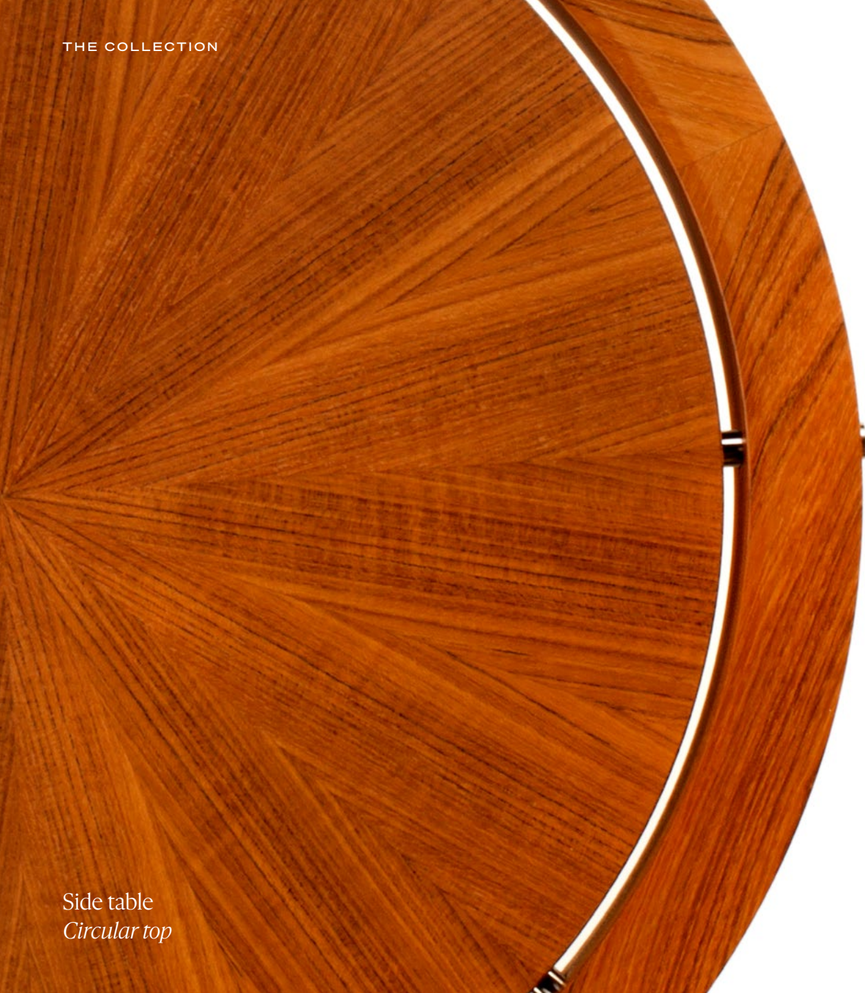
Side table Circular top