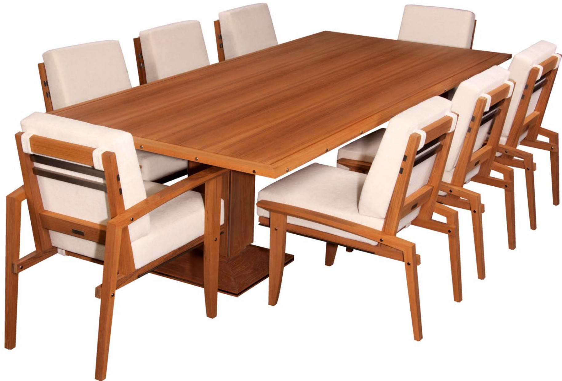
Dining table Rectangular top