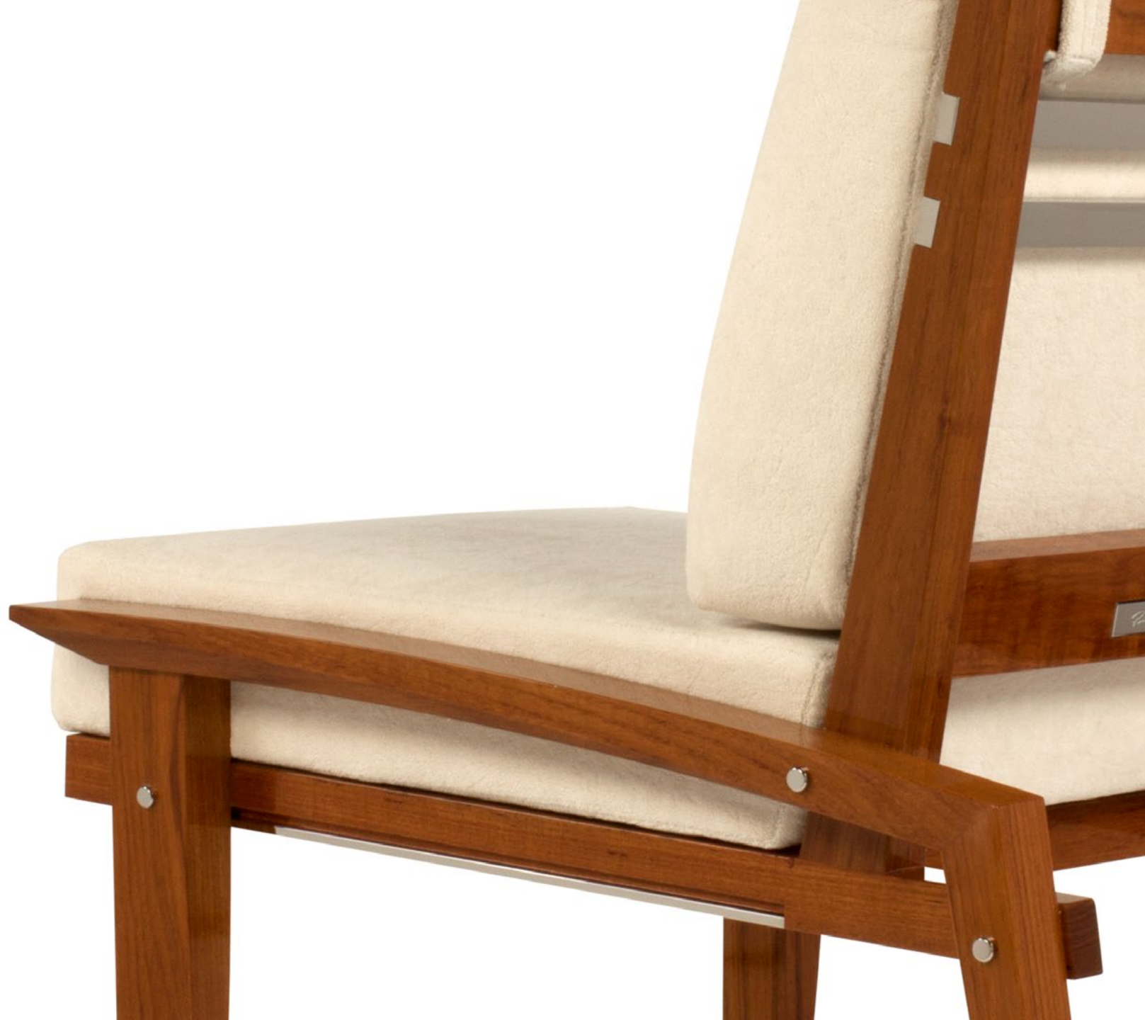
Side chair Custom design with Type 316 stainless steel accents and sabots