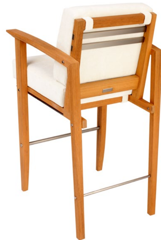
Bar stools On deck—MY Hasna