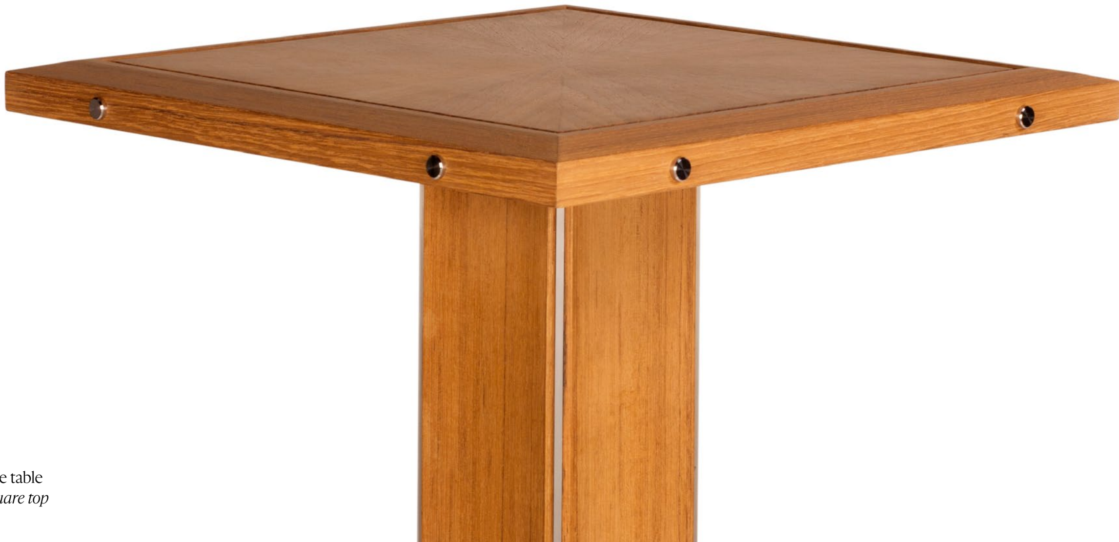
Side table Square top