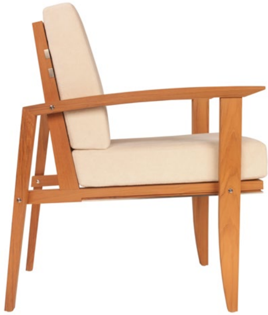
Dining chair With arms