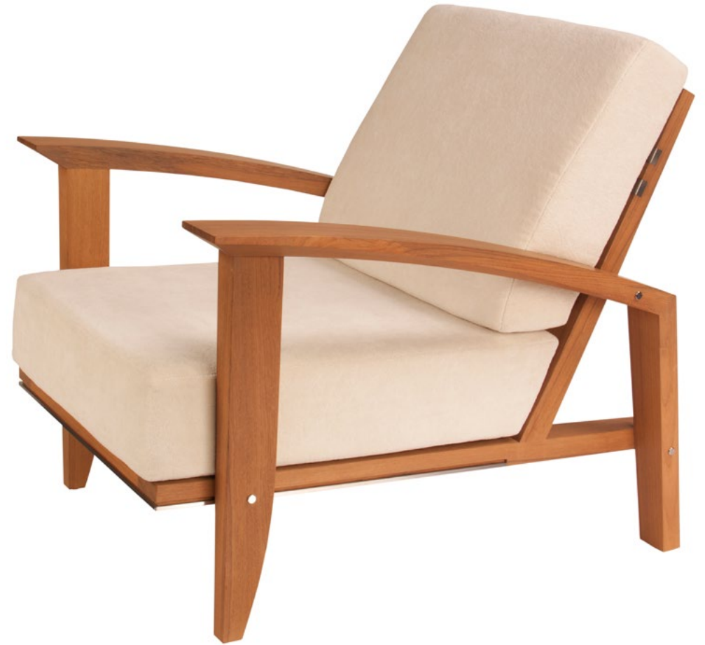
Lounger club chair