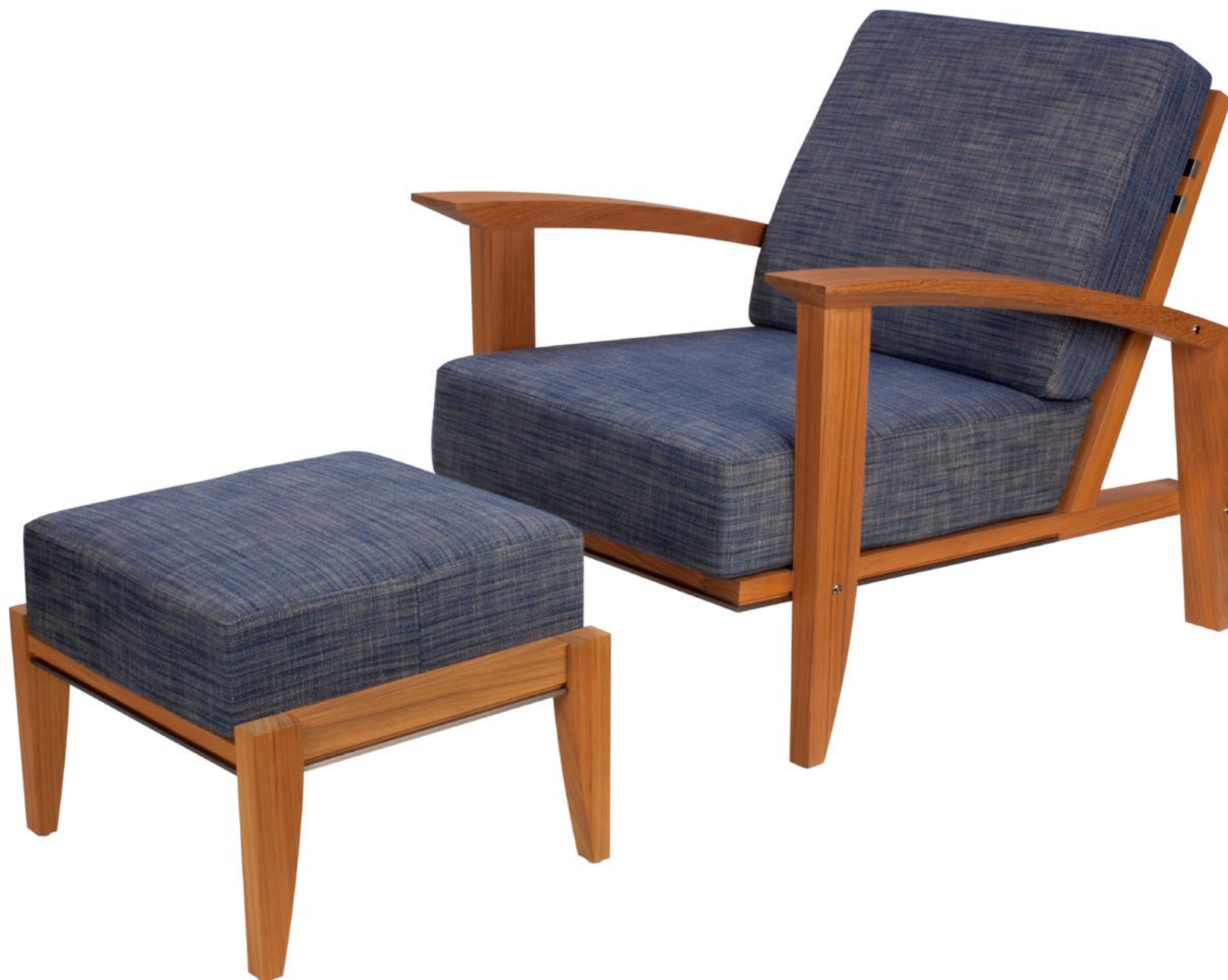
Lounger club chair With ottoman