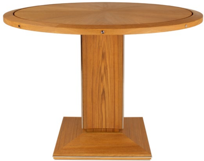
Dining table Circular top