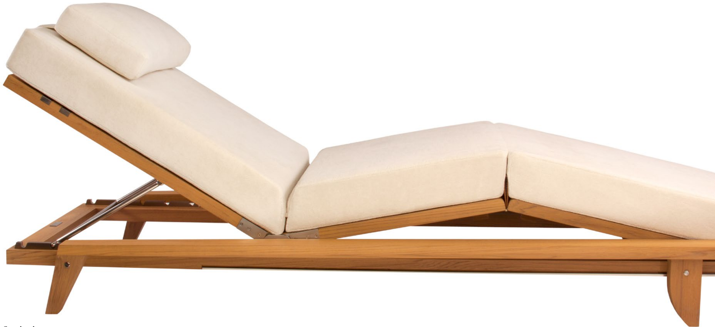
Sun bed Adjustable back