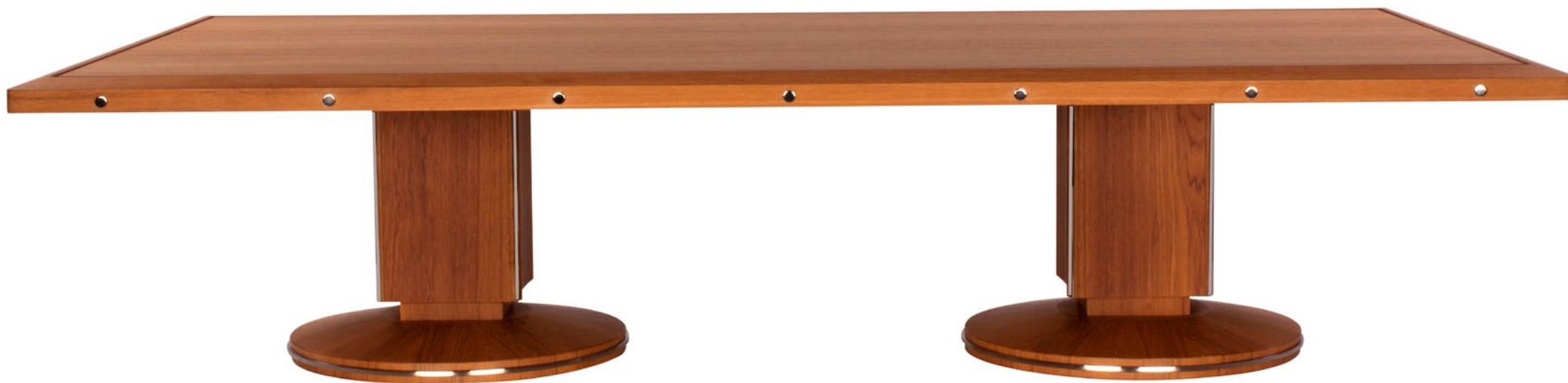
Cocktail table Custom design