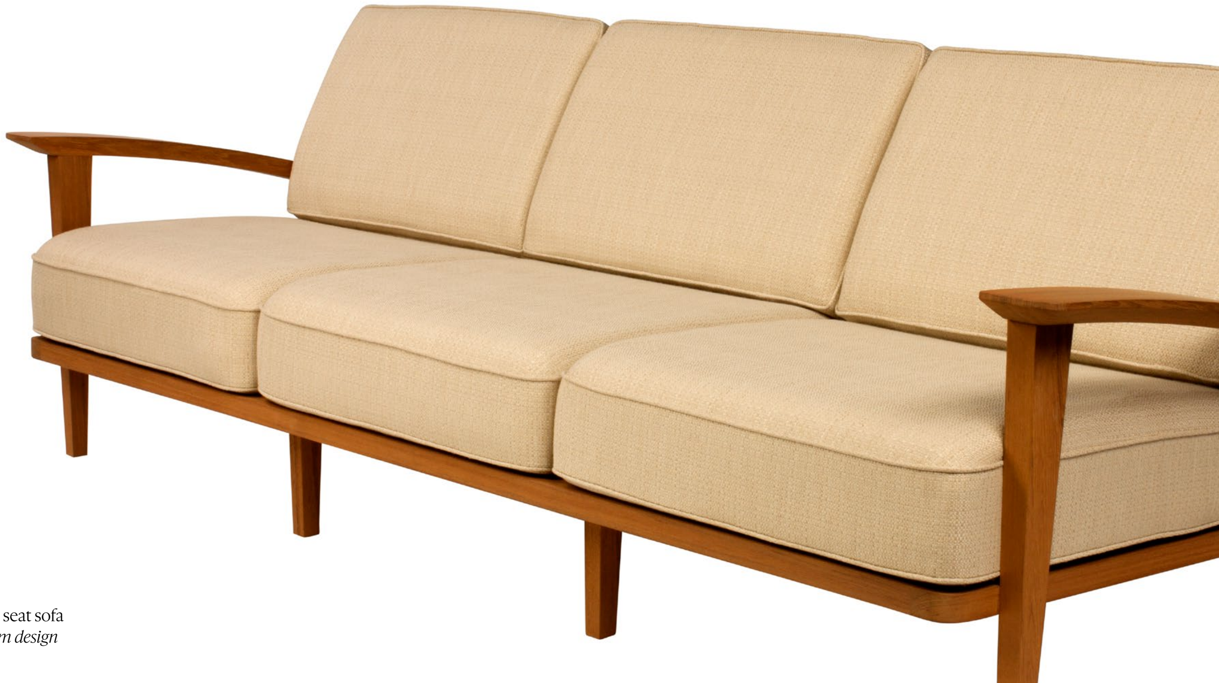
Three seat sofa Custom design